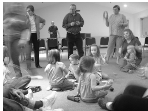
April Family Jam

Satellite Music Together Classes now available in Dudley, Sterling & Sturbridge.