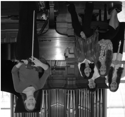
Above: Students gather following the annual Honors Recital. See Page 3.

Pakachoag Community Music School cordially invites alumni, friends, relatives and would-be musicians to join PCMS in the Great Hall for the School's