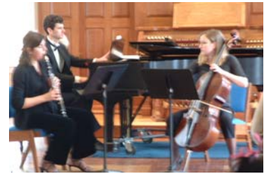
Faculty Perform a Beethoven Trio for Piano, Clarinet and Cello at the February faculty recital

Next on the list... A high quality upright piano to accommodate the growing number of Pakachoag students.